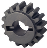
Pinion Z16 for rack