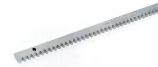
Galvanised rack plus fittings. 4 sections of 3.3 ft (1m) each