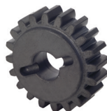
Pinion Z20 for rack