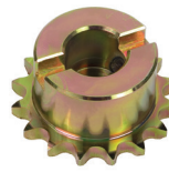
Pinion Z16 for chain