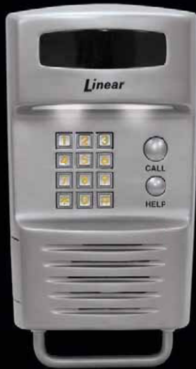
RE-1 STAINLESS STEEL