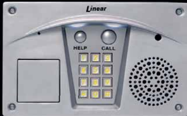
RE-2 STAINLESS STEEL